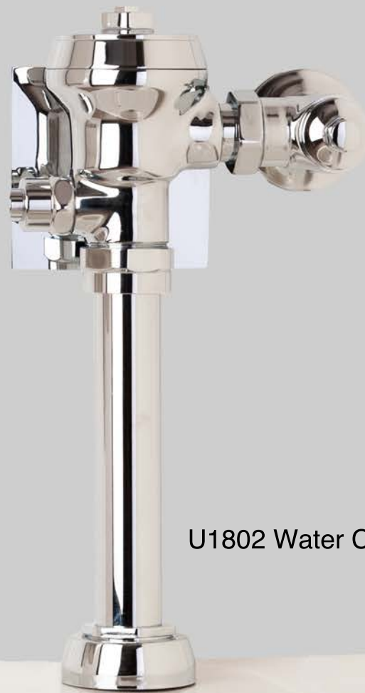
U1802 Water Closet