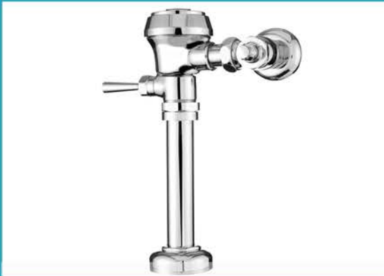
S402-1.28 (High Efficiency Toilet) Polished chrome plated flush valve, with chloramine resistant, self-cleaning bypass diaphragm, 1.28 gallons per flush.