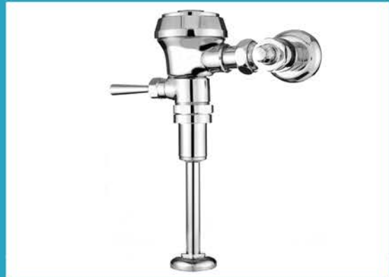
S451-0.5 (High Efficiency Urinal) Polished chrome plated flush valve, with chloramine resistant, self-cleaning bypass diaphragm, 0.5 gallons per flush.