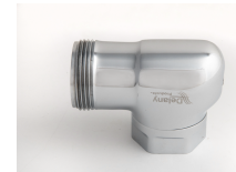
Patented TruStop Control Stop