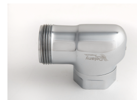
Patented TruStop Control Stop

Valve is in compliance with the applicable sections of ASSE 1037 and ANSI/ASME 112.19.2